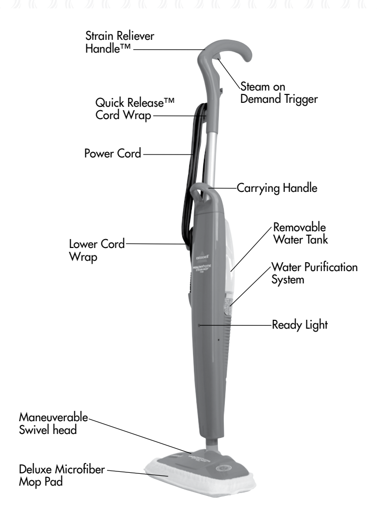
For replacement parts and accessories, see page 11